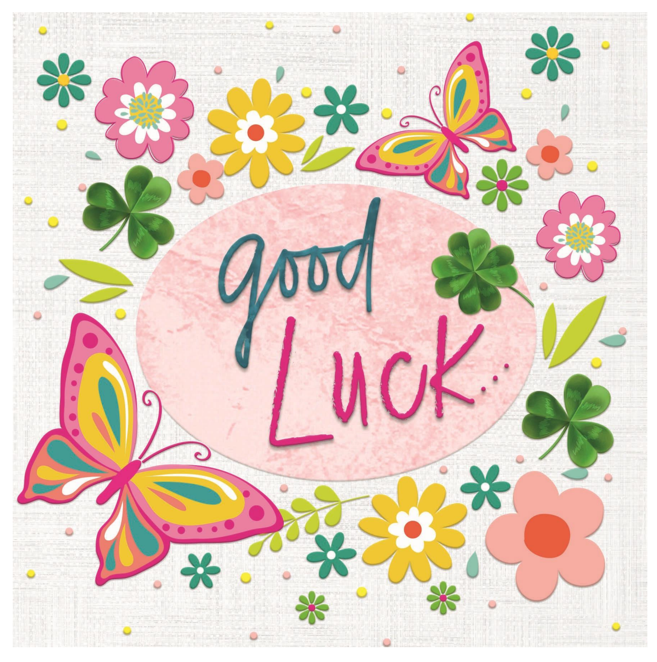
Good luck to our P7 pupils who are sitting entrance exams in November and December, please remember them in your prayers. The dates for assessments are: