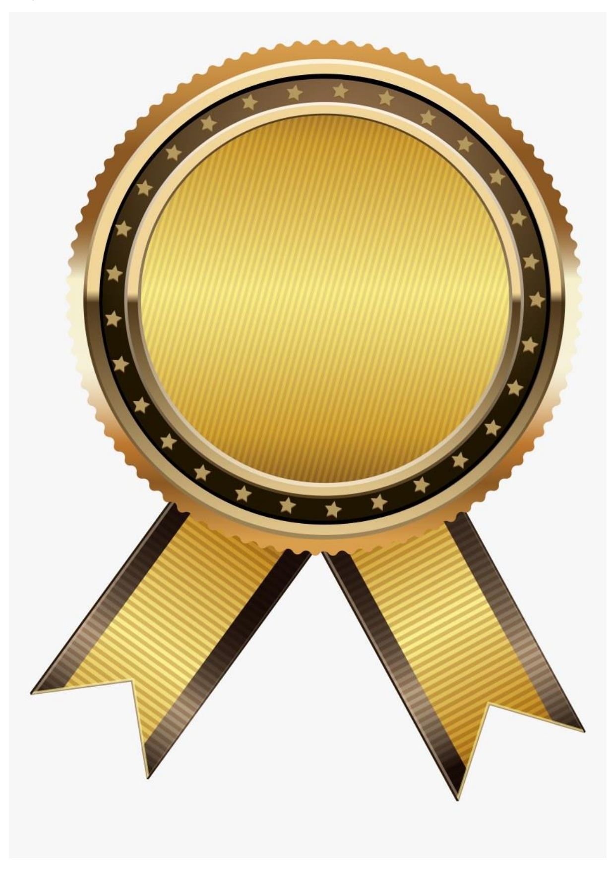
Pupils of the Month December