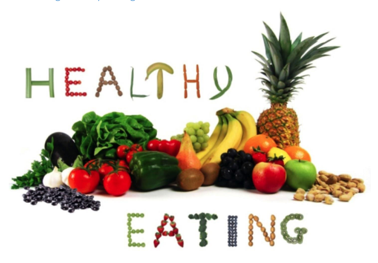
Here at St. Mary's on the Hill we promote Healthy Eating across the school. We encourage children to make healthy choices in what they eat and drink. During Breaktime we ask the pupils to make a healthy choice in regard to the type of snack they have mid-morning, this might include fruit, vegetables, crackers etc. Your support to help your child make a healthy choice for breaktime snack is much appreciated.