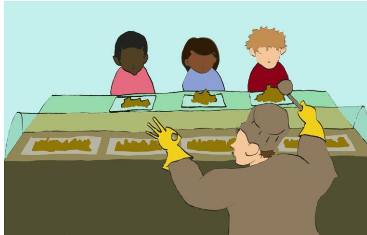
School Lunch Menu – September 2023